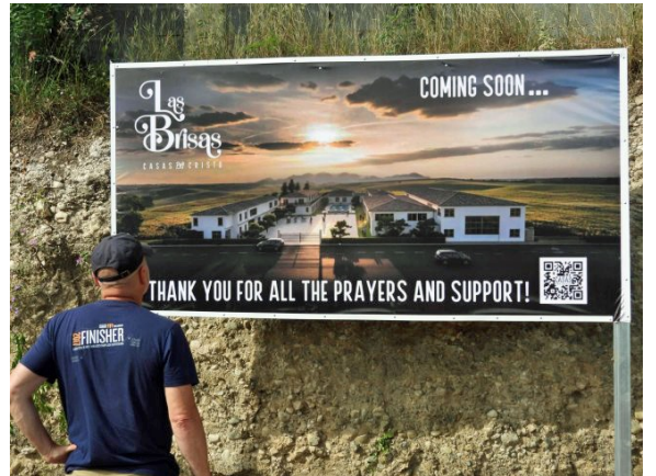
New base, warehouse conceptual drawing

As funds come in, a new Casas base of warehouse, dorms, kitchen, diningroom and pool will be built at this site north of Bisono and freeway entrance.