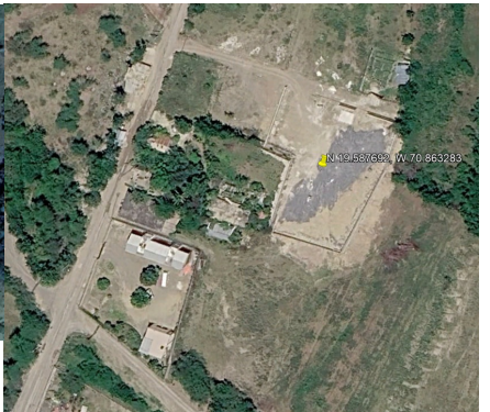
New site in 2026

As funds come in, a new Casas base of warehouse, dorms, kitchen, diningroom and pool will be built at this site north of Bisono and freeway entrance.