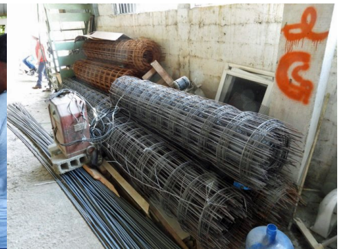
Rebar for floor