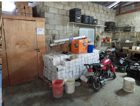
White cartons of nails