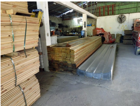
Lumber and roof steel