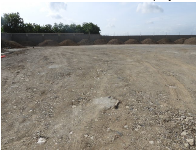
Leveled ground, new fill piles