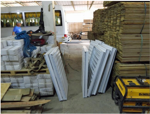
Nail cartons, windows, fiberboard