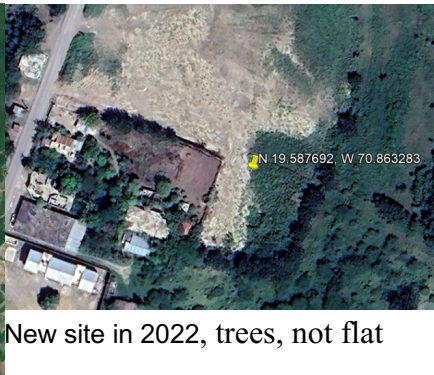
New site in 2022, trees, not flat