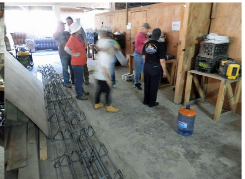
Rebar for floor edges