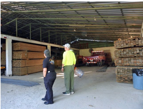
Warehouse entrance and lumber

Each day we stopped nearby at the warehouse to get equipment and tools for our construction work. Lumber, bags of cement, sand, and gravel, and the roof were already at the work site.